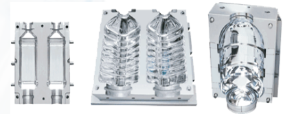
Single & Two Cavity Mould