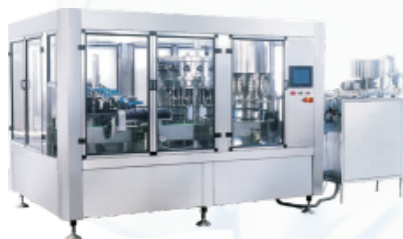
Mineral Water Filling Machine