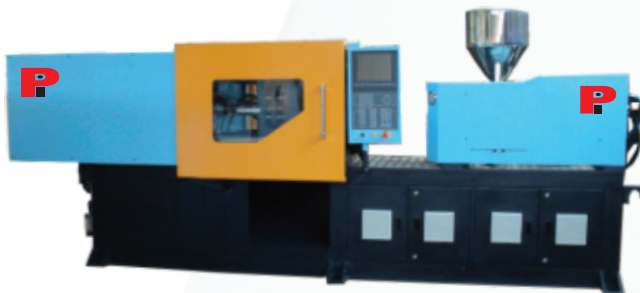
Injection Moulding Machine