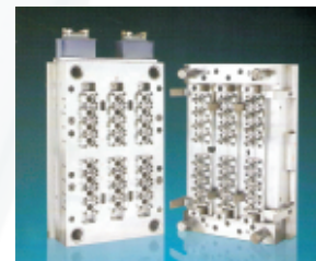
PET Pre-form Mould