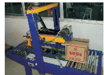
Carton Packing Machine